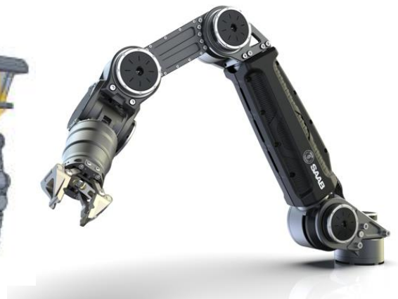
Ground breaking eM1-7 Electric Manipulator